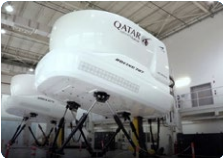
NITC Qatar Airways