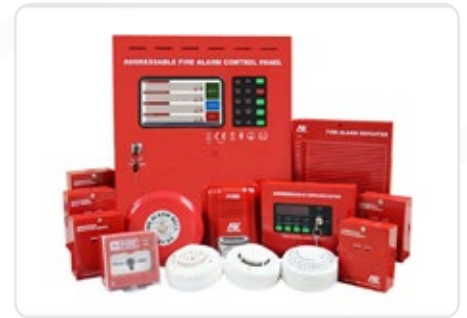
Fire Alarm System