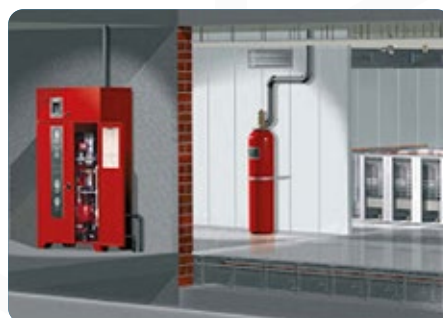
Novec Clean Agent System