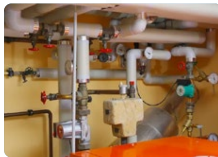
Chilled Water System