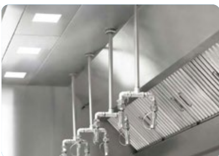
Kitchen Hood System