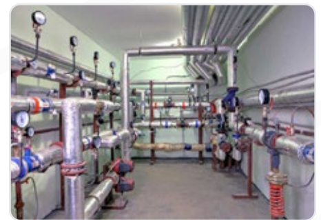
Chilled Water Piping