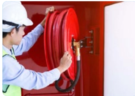
Fire Hose Reels & Racks